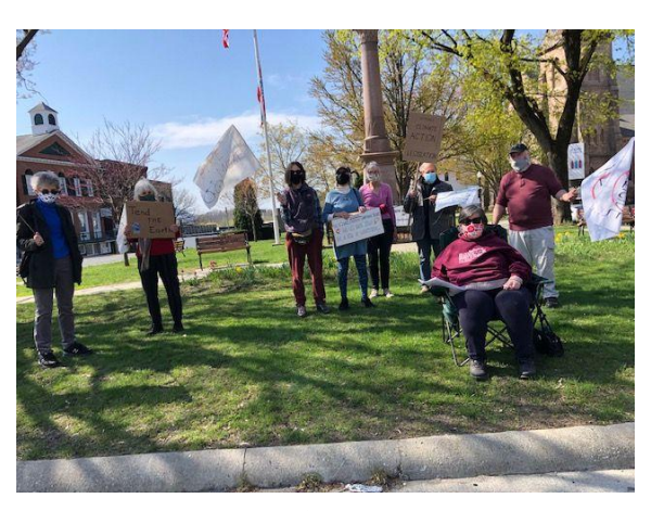
Green Team's Earth Day Demonstration