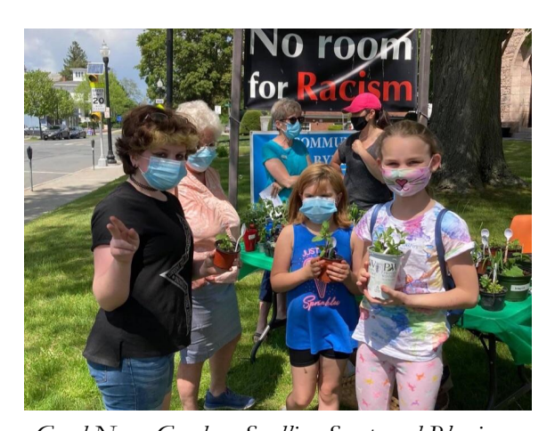
Good News Gardens Seedling Swap and Blessing