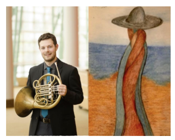
Concert & Art Gala