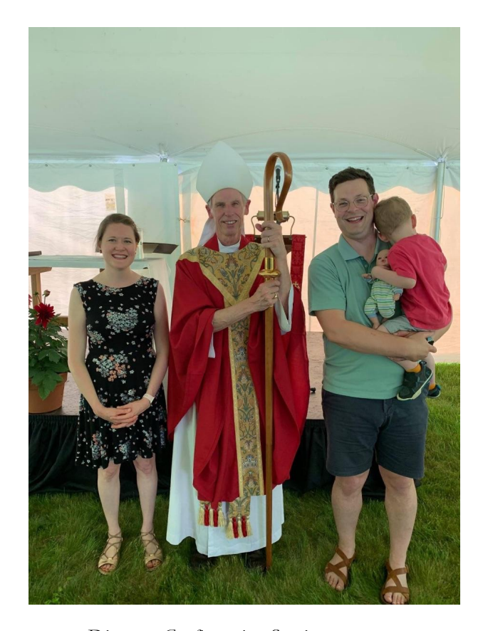
Diocesan Confirmation Service

We also found numerous ways to live into our mission and ministry. Here are some of the highlights: