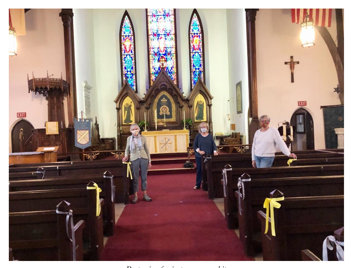
Preparing for in-person worship with yellow and grey ribbons to help us social distance

Those themes only continued in 2021. The successful creation of vaccines offered us an energizing hope that we would soon be able to gather again in-person. We spent the winter and early spring months preparing for in-person worship, and exploring how we could offer a high quality and meaningful live-stream of our worship. Our goal was to ensure worshippers could choose whether to attend in-person or online.